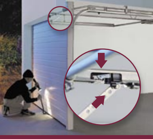
Boom-guided operation Patented door latching