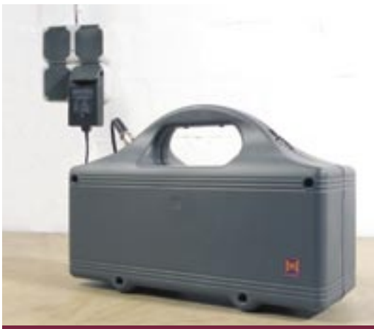
Power for up to 40 days Easy overnight recharging